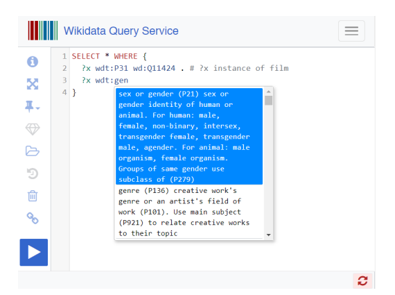
Fig. 1. Autocompletion for movie properties on the Wikidata Query Service's query editor (https://query.wikidata.org) based on the "gen" prefix

Next they wish to query for the genres of the film, and use the autocompletion feature typing "gen". However, the first suggestion is sex or gender (wdt:P21), which does not make much sense in the context of the current query. The second suggestion, genre (wdt:P136), is the one being sought.<sup>1</sup>